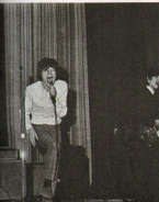
be everyone's all time favorite, (except, of course, we'll pay a surprise visit to K'R'L'A*N'D