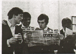
Before you could turn around, it was Dave Clark Five time, and the BEAT was there to cover the show for you (of course)! No wonder they liked that issue! Look at the headline! The show was fab!