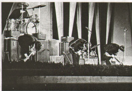
How many of you cried at that final bow? All too soon, the greatest group in the world left our town, but we really didn't feel too bad. After all, they said they would be back!