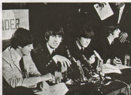
The press conference at the Cinnamon Cinder gave many of you a chance to see the boys close up. Of all the places they stayed at in this country, they liked K'R'L'A*N'D the best!