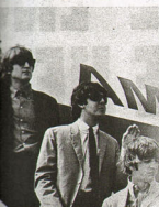
day! After days of breathless excitement, course, all the pictures of their whole stay