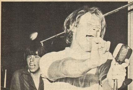
... THE AGONY