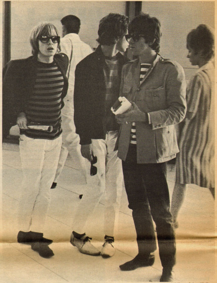
... STONES (l. to r.) Brian Jones, Mick Jagger, Keith Richards—and passing friend?