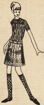
The Total Look — matched stockings and sweaters.