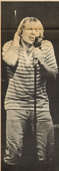
... THE ECSTASY