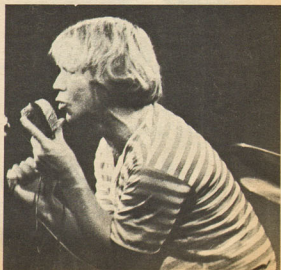
... THE STRUGGLE

So now, exclusively in The BEAT , the first action photos of opening night with Barry McGuire.