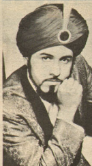
... SAM THE SHAM

Be sure to mail in your ballot so that your favorites will be included in the top ten finalists. Only ballots submitted on the official BEAT entry blank will be counted by the judges.