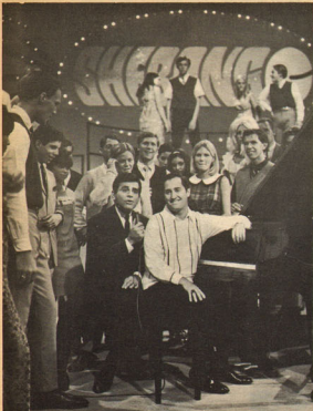
ON THE SHEBANG SET , surrounded by the "regulars" on his show, Casey chats with one of his featured guests, Neil Sedaka.

La Cienega Store open Mon., Thurs. Eves 'til 9 P.M.