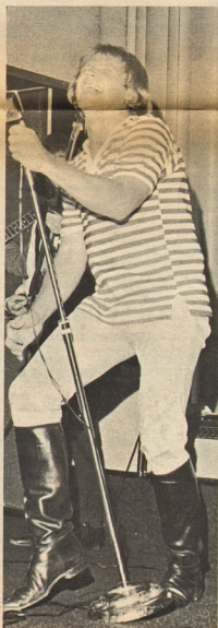
... THE SORROW

On a recent night in Hollywood, our trusty BEAT photographer—along with many members of the Hollywood "In Set"—fell by a new night club on the Sunset Strip, known as The Trip . The object: to see and hear the dynamic new sensation in the field of folk and roll, Barry McGuire.