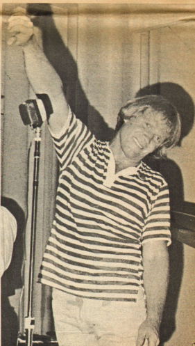
... THE JOY!!