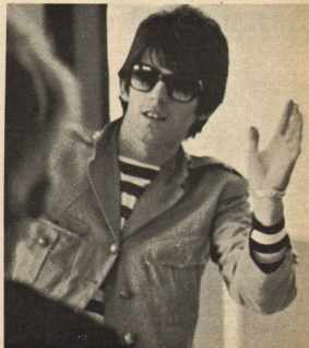
BEAT

Many entertainers don't bother with their fan mail especially when they receive as much as the Stones do, but Keith says: "We do answer our fan letters." Yeah, well then how come you didn't answer my letter. And after I enclosed seven cubes of sugar, too!