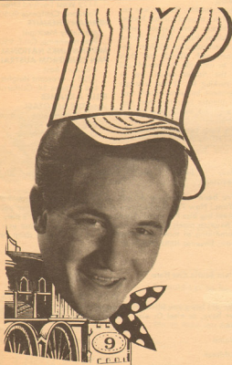
ROGER MILLER HAS DONE IT AGAIN. His "Engine, Engine No. 9" is one of the hottest on the charts.