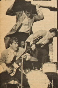
PAUL REVERE AND THE RAIDERS - colorful, exciting entertainers.