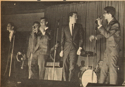
THE KRLA DEEJAYS ham it up on stage at Long Beach Arena