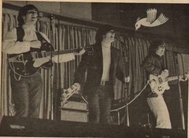
THE BYRDS were cheered almost as wildly as The Stones