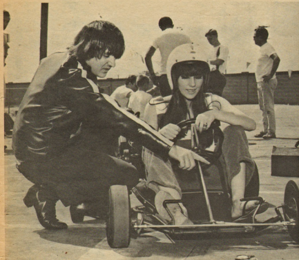
SONNY AND CHER whose recording of "Just For You" is a nationwide hit. Prepare for another kind of spin.