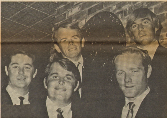
THE FABULOUS BEACH BOYS have done it again! They have a new smash record, "HELP ME, RHONDA," and a top-selling album, "The Beach Boys Today." They earned nearly a million dollars last year in less than 80 concerts, and the Southern California stars should do even better this year.

BULK RATE U.S. Postage PAID Permit No. 25497 Los Angeles California