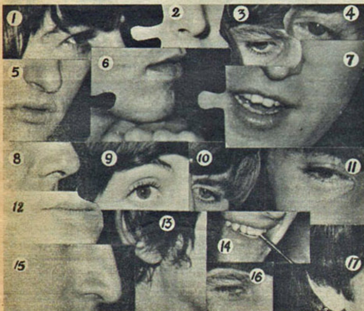
THE BEATLES SCRAMBLE CONTEST PICTURE that brought in so many entires and deluged the offices of the KRLA BEAT. How many did you identify correctly? The actual answers are: 1—George. 2—Paul. 3—Ringo. 4—John. 5—Ringo. 6—George. 7—John. 8—George. 9—Paul. 10—Ringo. 11—John. 12—Paul. 13—George. 14—Ringo. 15—John. 16—Ringo. 17—Paul. Derek Taylor got them all the first time.

Out of hundreds of entries received, there were a number of correct answers, but an El Monte girl got in the earliest post marked entry. We'll have more BEATLE CONTESTS in upcoming issues.