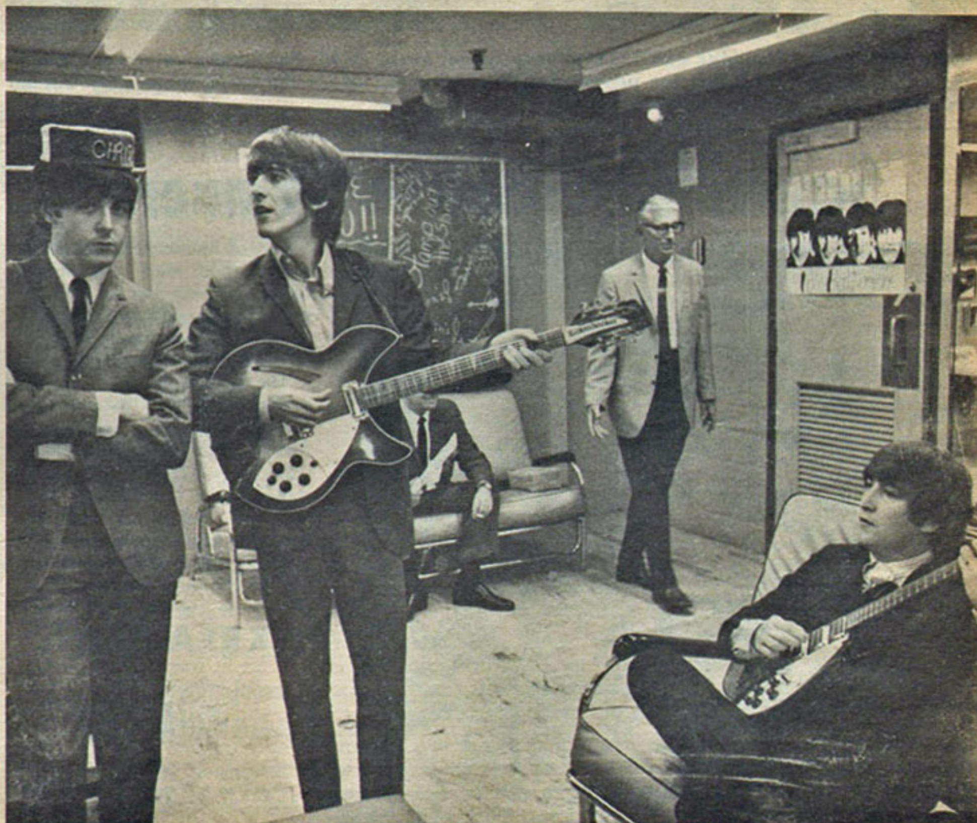
Like a postman who goes for a walk on his day off, THE BEATLES relax for a few moments by strumming their guitars. The kookie hat is a gift from an admirer who finally got to see them for a few seconds.