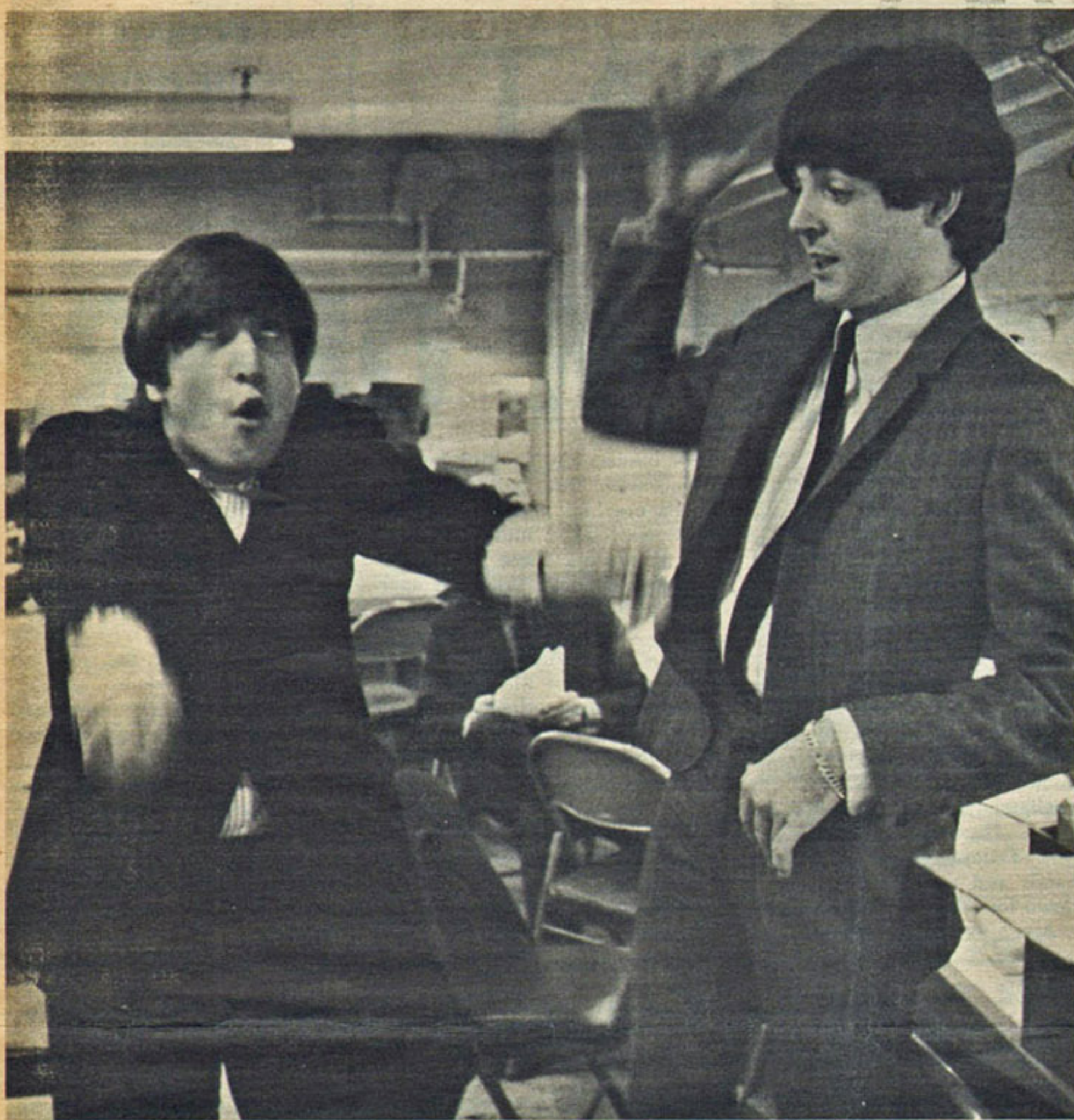
ANOTHER OF THE EXCLUSIVE BEATLES photos to appear in the BEAT. The camera caught the pair in an unguarded moment inside the private dressing rooms set up for the group while they worked long hours on their island adventure story.