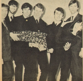
THE NASHVILLE TEENS ARE STILL LOOKING

ASH GROVE 8162 Melrose Ave., Los Angeles OL 3-2070 JUNE 29 - JULY 11 — (NO MINIMUM AGE LIMIT)