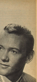
RIGHTEOUS BROTHERS STAY WITH WINNING SOUND

Eric Burdon of the Animals had this to say about it: "I think they made it after 'Lovin' Feeling'. It's a typically American habit of producing records with the same sound. This madens me about American artists who have one big hit and their