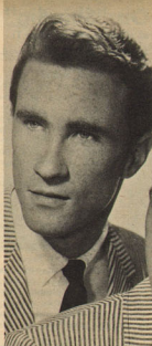
ANIMALS' ERIC BURDON

Eric Burdon of the Animals had this to say about it: "I think they made it after 'Lovin' Feeling'. It's a typically American habit of producing records with the same sound. This madens me about American artists who have one big hit and their