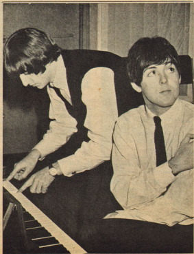
PAUL and RINGO