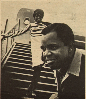
DIANA ROSS AND BERRY GORDY—"Happily married"—not really.

The pop force of the year was pulled off at the expense of Supreme lead singer, Diana Ross, and her Motown chief, Berry Gordy.