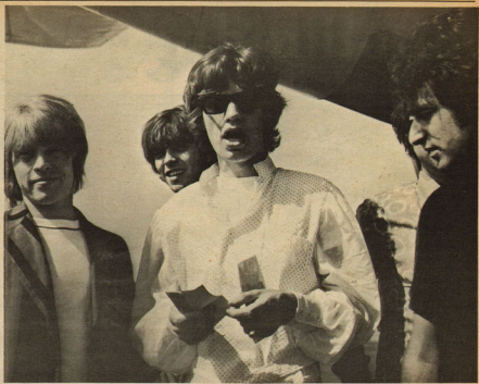
... BRIAN JONES AND MICK JAGGER are greeted at the airport by three of the Standells

"But you've got to be careful with follow-ups now. You can't get away with similar follow-ups in this business anymore. We can't do another 'Winchester Cathedral' but we've got to do something with the same recognizable sound that people can identify."