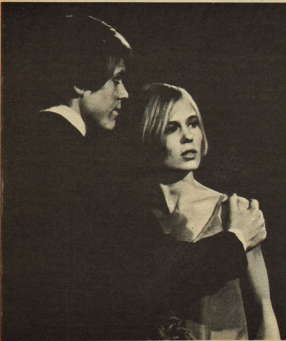
... HERMAN AND TIPPY IN SCENE FROM "CANTERVILLE GHOST."

But she did mind them saying "WHAT's that?" (To Be Continued Next Issue)