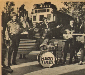
THE HARD TIMES will sing wherever a crowd gathers to hear them.