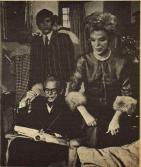
... HERMAN READS OVER THE SHOULDER OF DOUG FAIRBANKS JR.