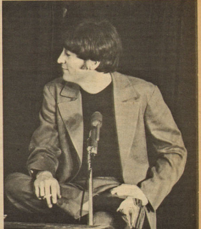
BEAT