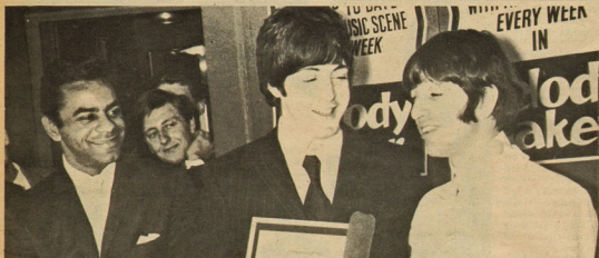
... JOHNNY MATHIS AND PAUL MCCARTNEY grin understandingly as Ringo Starr does his very best to explain a point.