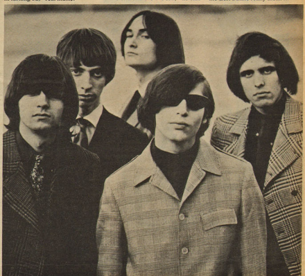
THE LEFT BANKE (l. to r.-front) Steve Martin, Jeff Winfield, (rear) Mike Brown, Tom Finn, George Cameron.

The Left Banke are refreshing for their originality. A lot of groups talk about defying trends but few mean it. You get the impression the Left Banke really mean it.