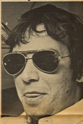
BEAT