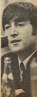
And we were going down from the top, so I suppose we were above average. It takes a long time if you're in a big class of forty. They can't teach you properly.