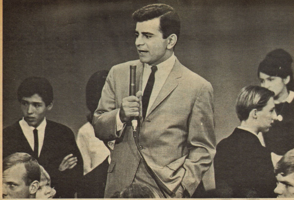
CASEY KASEM, top rated KRLA deejay, as he appears on the new television show starring the personable and informative man of music. The show, "SHEBANG," is seen daily on Channel 5, KTLA. Viewers actually participate in show with contests, and performers appearing regularly include some of top stars in show biz. Casey combines live talent with special film clips of outstanding performances. Popular show is produced by Bill Lee and Hall Galli and film is syndicated nationally by television star Dick Clark.