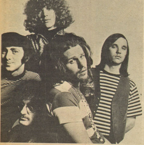
COUNTRY JOE AND THE FISH, one of the most popular groups to come out of the music scene in San Francisco. The new album, "Feel Like I'm Fixing to Die," is already rising on the charts.