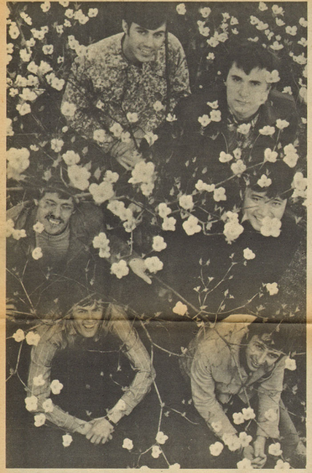
CONGRATULATIONS TO THE ASSOCIATION . . . the top pop group! See On The Beat for details.