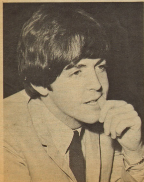
The Worrier . . . What's Bothering Him?