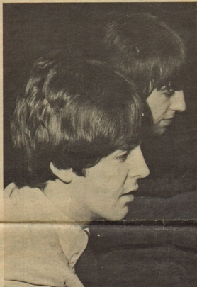
The Bachelors . . . What Are Their Plans?