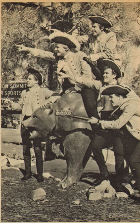
Paul Revere and the Raiders . . . Charge!